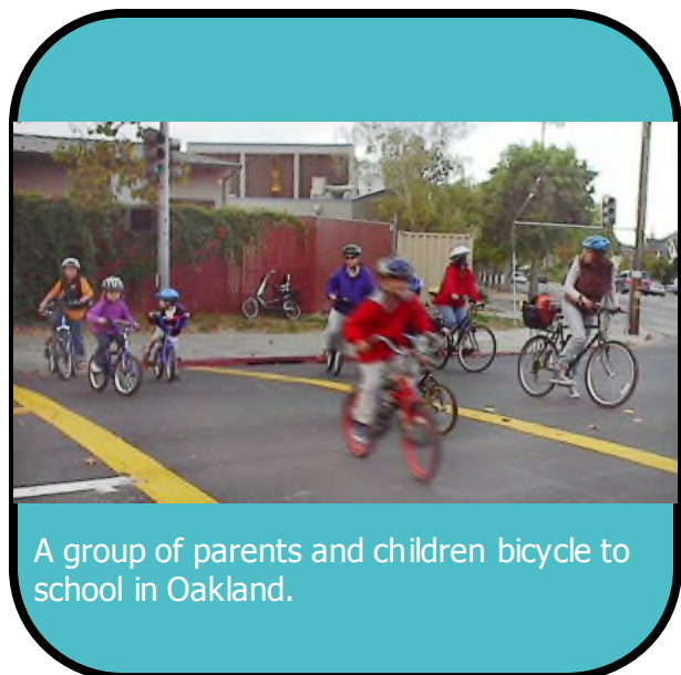
A group of parents and children bicycle to school in Oakland.

The results from the Marin SR2S pilot program have been so impressive that they have spurred both the federal government and the State of California to establish Safe Routes to Schools grant programs to create similar programs. Every state in the nation has recognized the potential benefits from