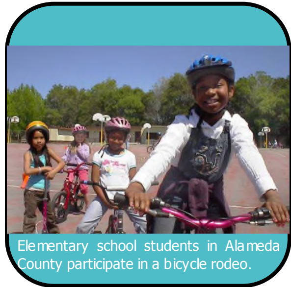
Elementary school students in Alameda County participate in a bicycle rodeo.

Safe Routes to Schools (SR2S) is a comprehensive approach to these problems. SR2S combines established, tested methods to encourage schoolchildren to walk, bicycle, and carpool to school, and applies them all at once, in concert with each other. SR2S utilizes traffic engineering, safety education, bicycle and pedestrian encouragement programs, traffic law enforcement, and continual program evaluation. It also develops extensive partnerships by engaging students, parents, school faculty, police, city planners, and elected officials in a unified effort.