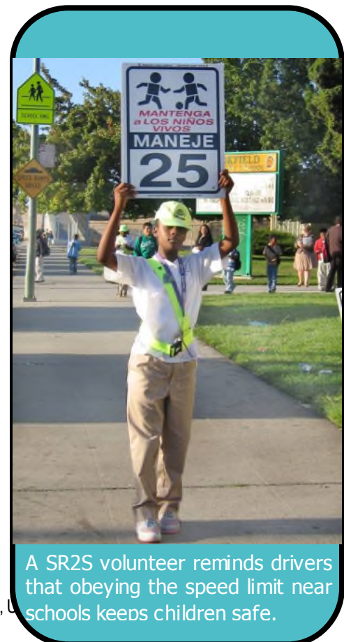
A SR2S volunteer reminds drivers that obeying the speed limit near schools keeps children safe.

Other encouragement programs involve ongoing activities throughout the year, in which students complete certain tasks on their own, such as bicycling to school a certain number of times, or carpooling instead of being driven alone. Other approaches track the reduction in greenhouse gas emissions associated with students walking or bicycling to school. By incorporating elements that encourage students to bring SR2S elements home,