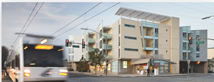
Gish Affordable Apartments, San Jose

Connect can be recommended to developers or incorporated into the development review process. You can also use Connect to engage residents and inform future neighborhood or community planning. The “project report” feature synthesizes useful information at a glance.